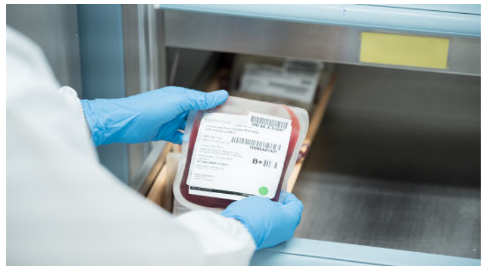
Blood and Organ Transport