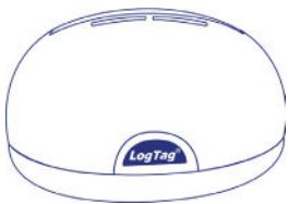
LTI-HID Not Included (Required) Order Code: LTI-HID