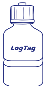
Glycol Buffer Not Included Order Code: Glycol Buffer-70ml