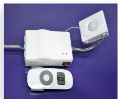
Sensor with Receiver & Emitter