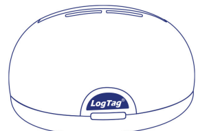
LTI-WiFi Not Included