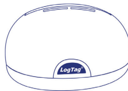
LTI-HID Not Included